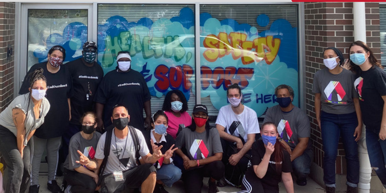
Some of the PWR team before our annual needle clean-up in September 2020