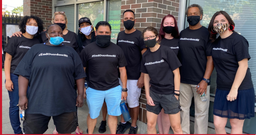
PWR staff on International Overdose Awareness Day, 08/2020

We know the importance of collaboration in meeting the needs of the people we serve.